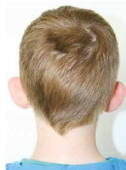
Eight-year-old boy BEFORE